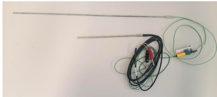
Figure 1: Example image of a non-precious thermocouple. Shown here: a type K thermocouple with a reference junction.